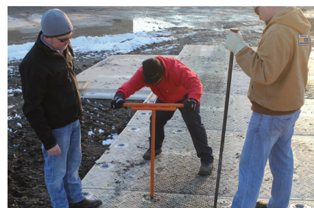
The #1 trusted access matting in the world.

Signature Systems Group offers the highest quality and full line of matting products for any size project and any type of event – anywhere in the world.