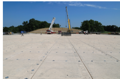
Non-absorbent HDPE prevents cross-contamination between sites, allowing for multiple uses