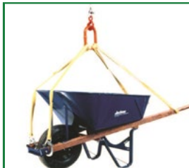
WHEELBARROW SLING (70-28)