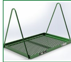
BRICK TRAY (70-48)