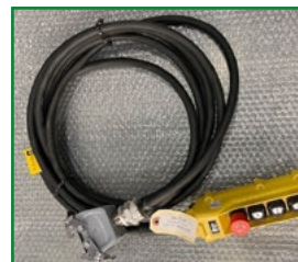
LEO VFD PENDANT WIRELESS VERSION (30-71-3)