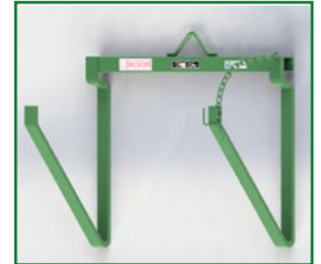
SCAFFOLD FRAME FORK (70-22) 600 LB