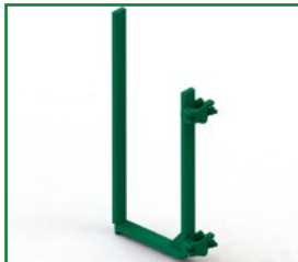
COUNTERWEIGHT CLAMP SET (60-1)