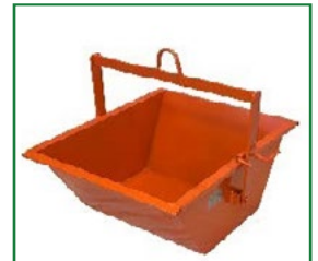
DUMPSTER BUCKET (70-58) 21 GAL (70-59) 39 GAL (70-60) 52 GAL