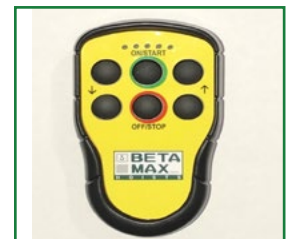
BETA MAX TRANSMITTER (10-664)