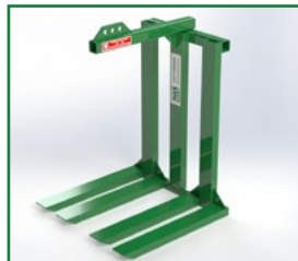
BLOCK FORK (70-23) 800 LB