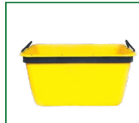
MUD TUB (70-41) 1/4 YRD (70-42) 1/3 YRD