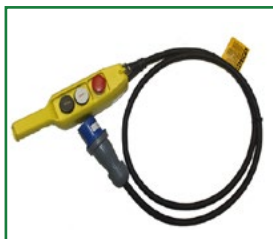
6FT PENDANT CONTROLLER (50-9-1)