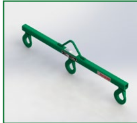
SPREADER BAR (70-26) 32" (70-27) 40"