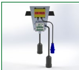
WIRELESS DUAL REMOTE KIT (70-430-1) 110V, 1PH, 20A (70-430-2) 220V, 1PH, 20A (70-430-3) 220V, 3PH, 20A