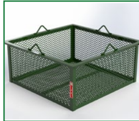
EQUIPMENT BASKET (70-49) 400 LB (70-45) 800 LB