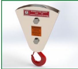
DOUBLE ROPE KIT (70-9) LARGE (70-2) HEAVY DUTY